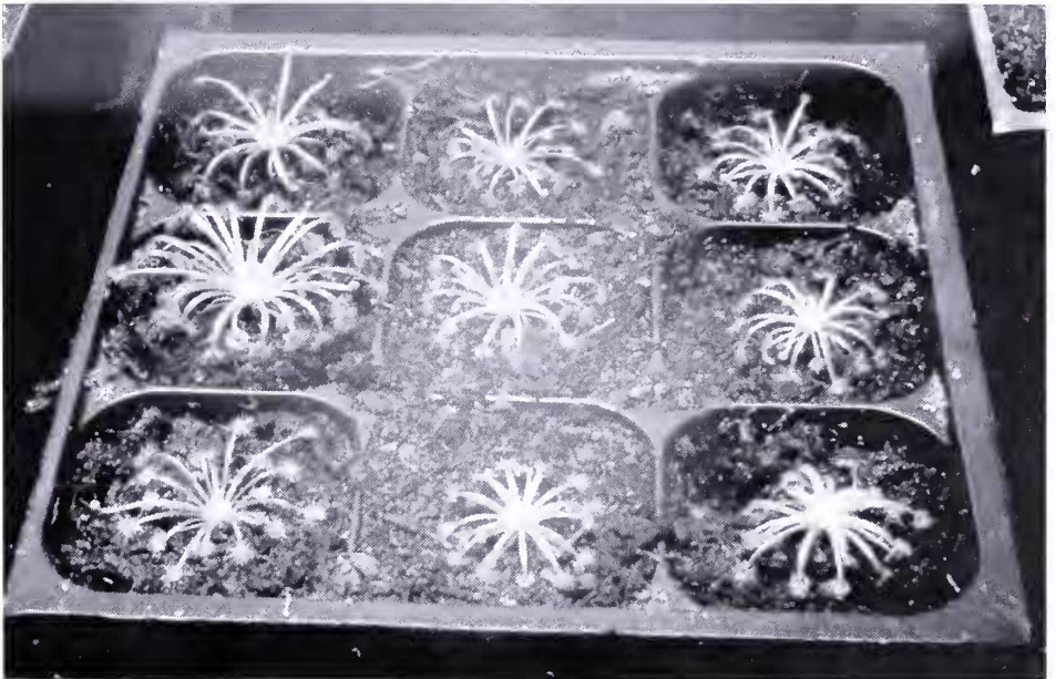
Figure 3: Young plants of D. derbyensis growing in heated water.